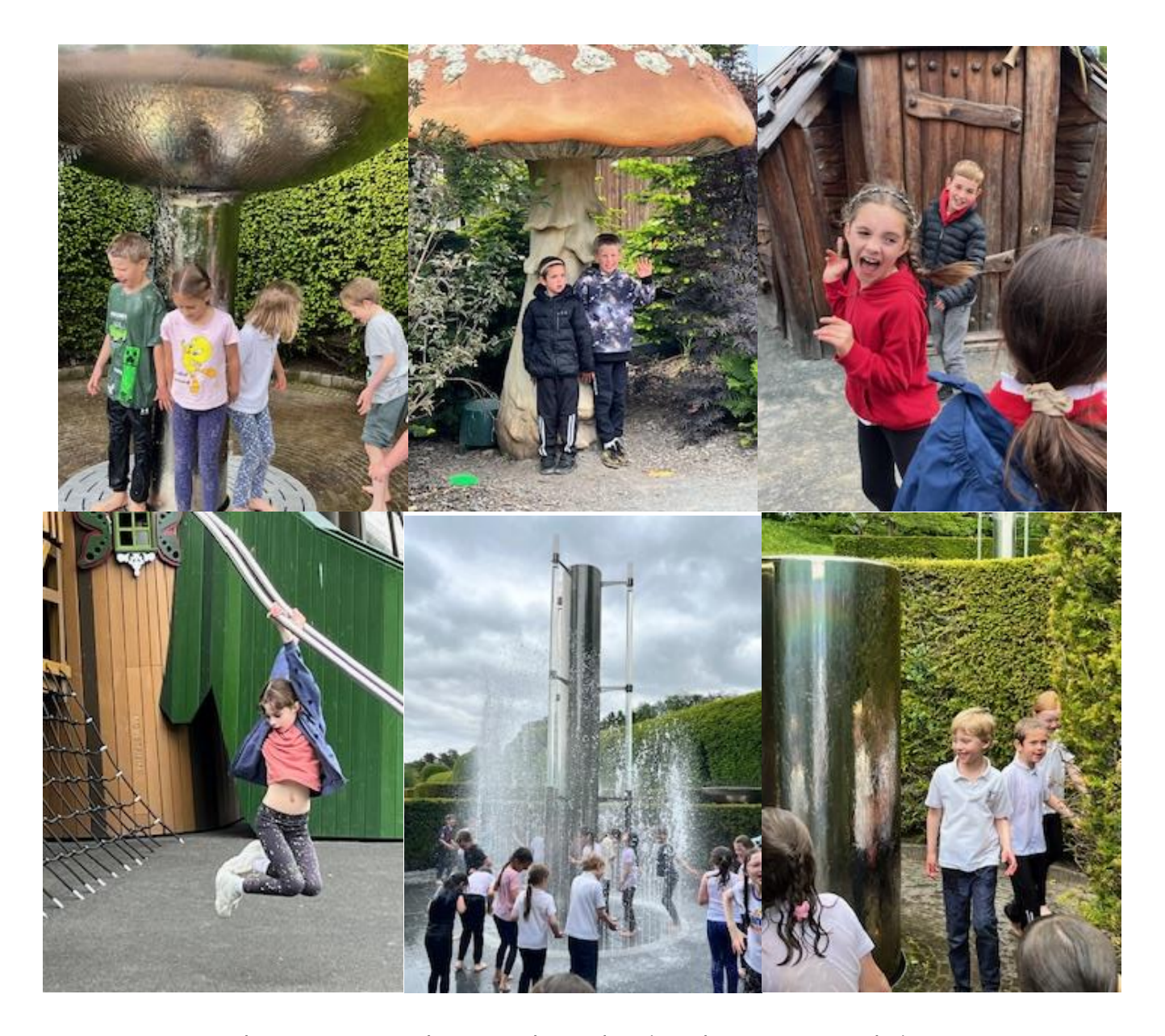
There are more photographs and action shots on our website.